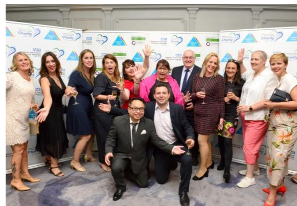
Some of the 2019 Patient First Star Awards attendees