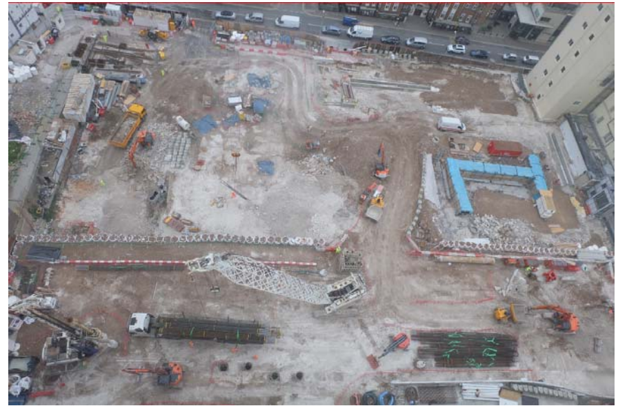
30 th May 2017