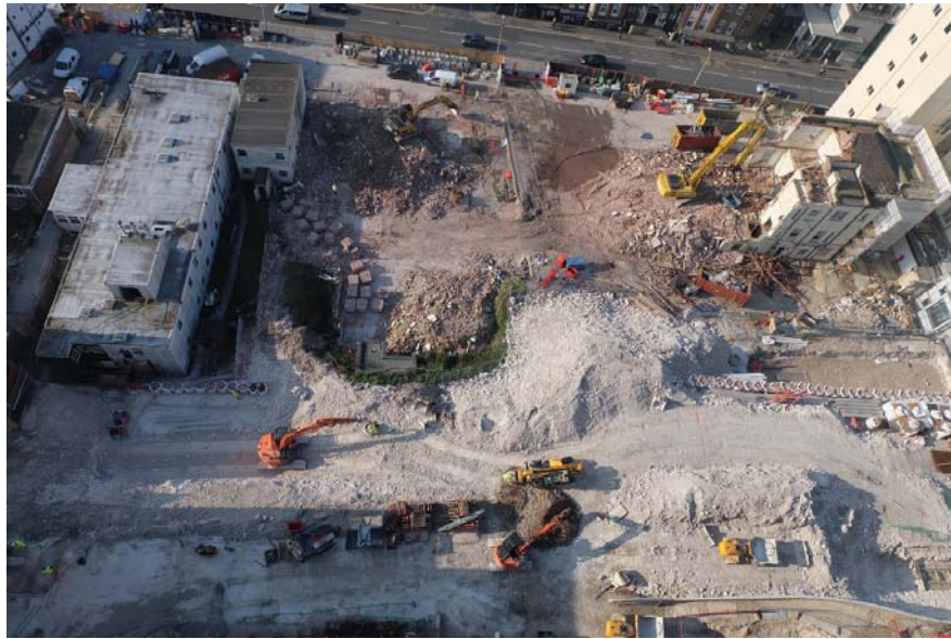
22 nd March 2017