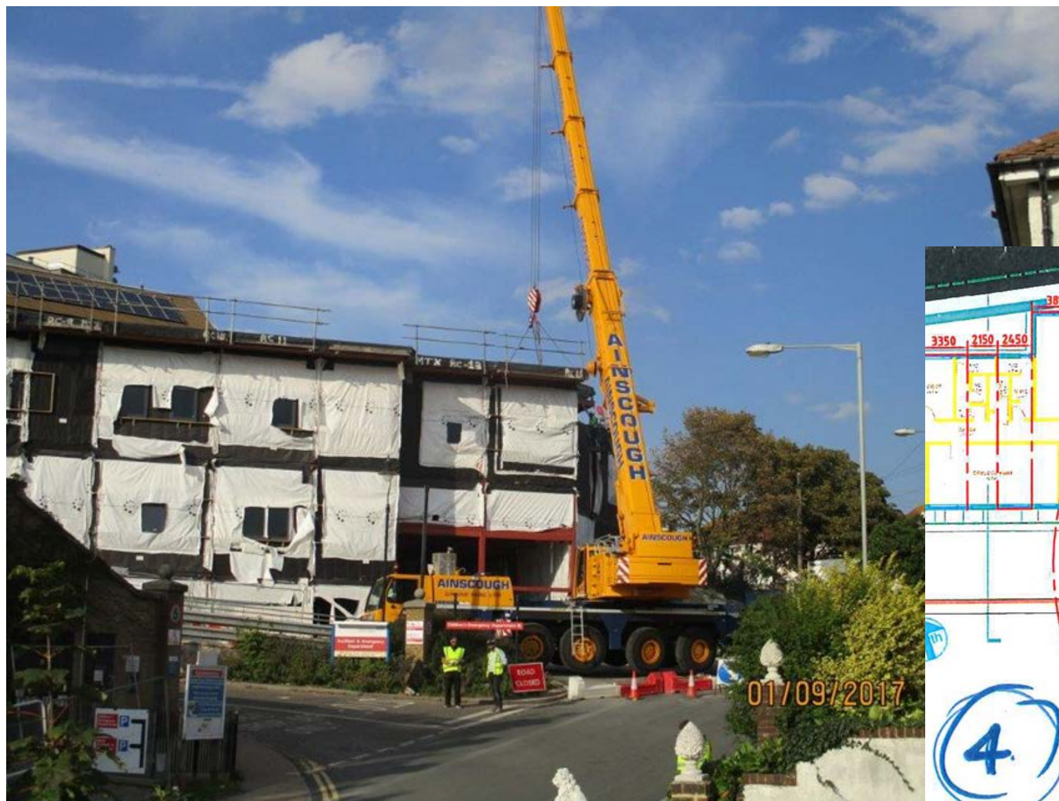
Crane set up along North Service Road