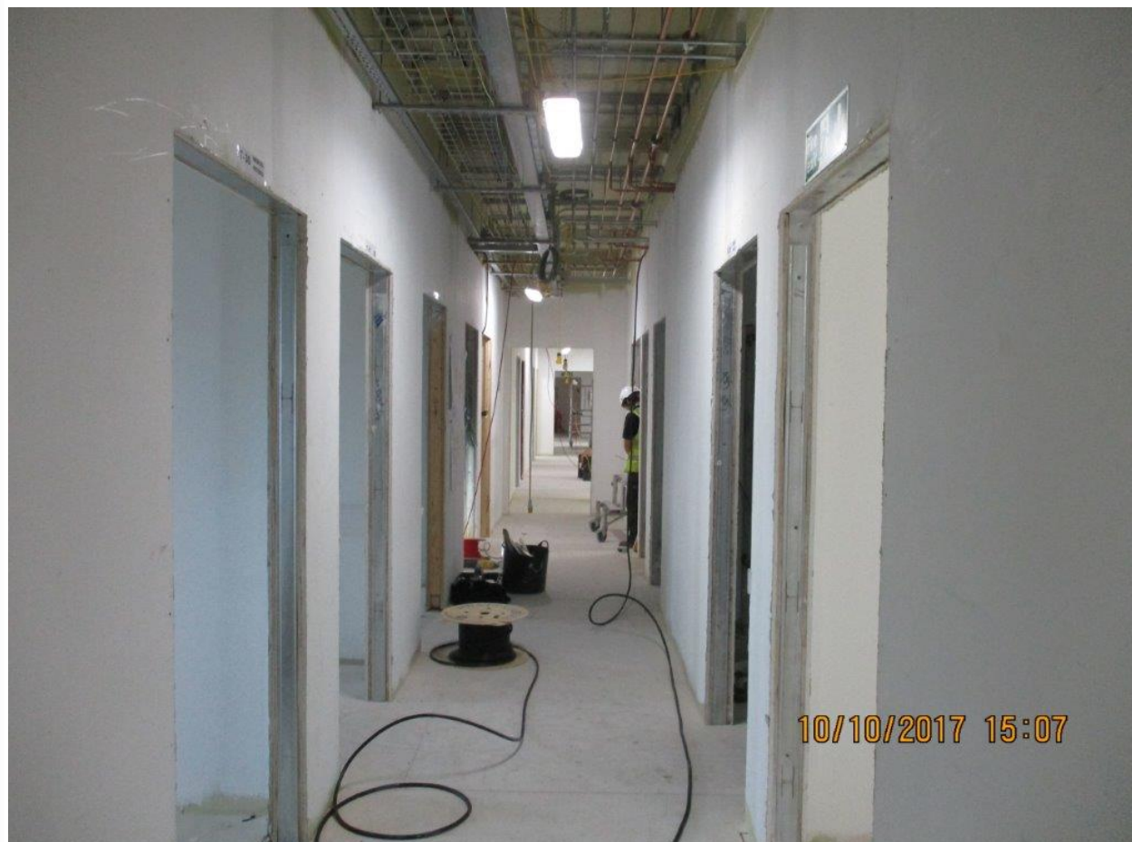
Internal Office fit out works