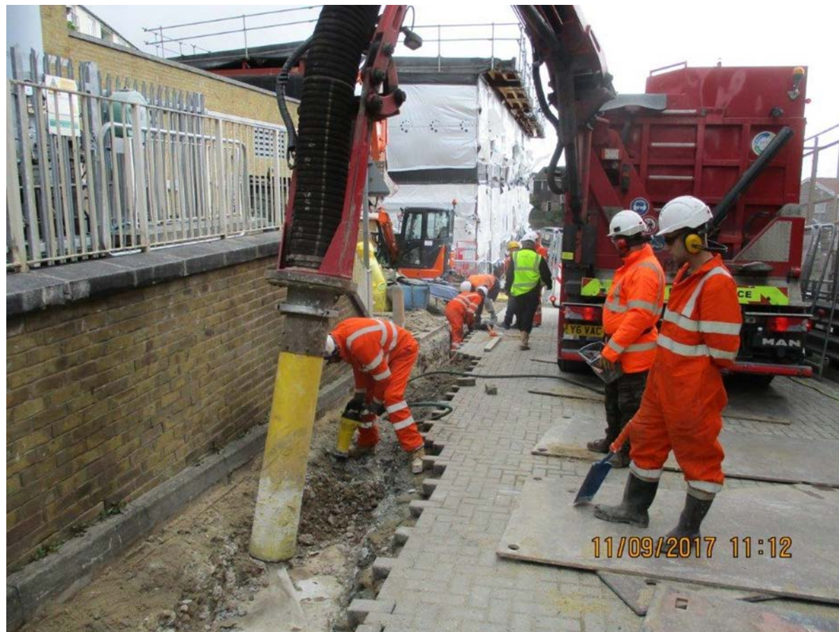
Suction excavator for Infrastructure works