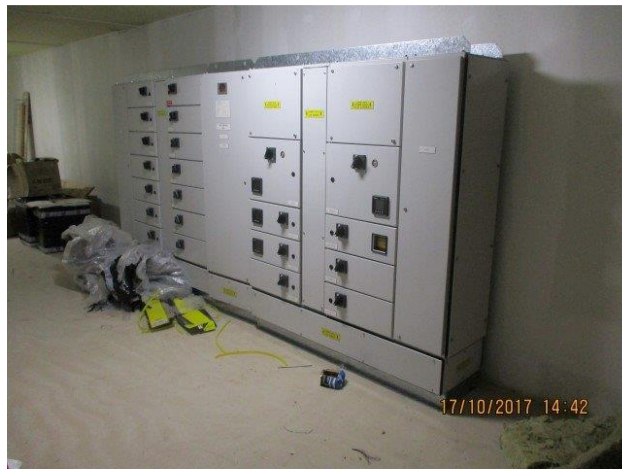
Plant room fit out works