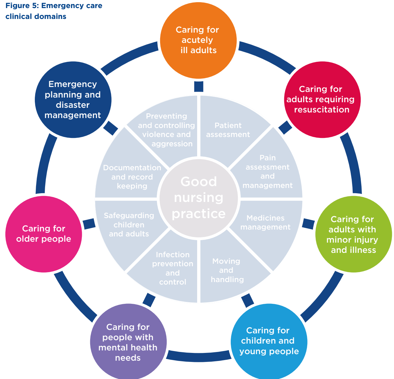
Figure 5: Emergency care clinical domains