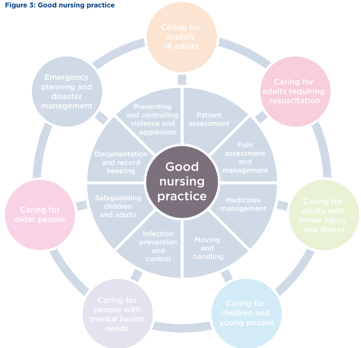
Figure 3: Good nursing practice