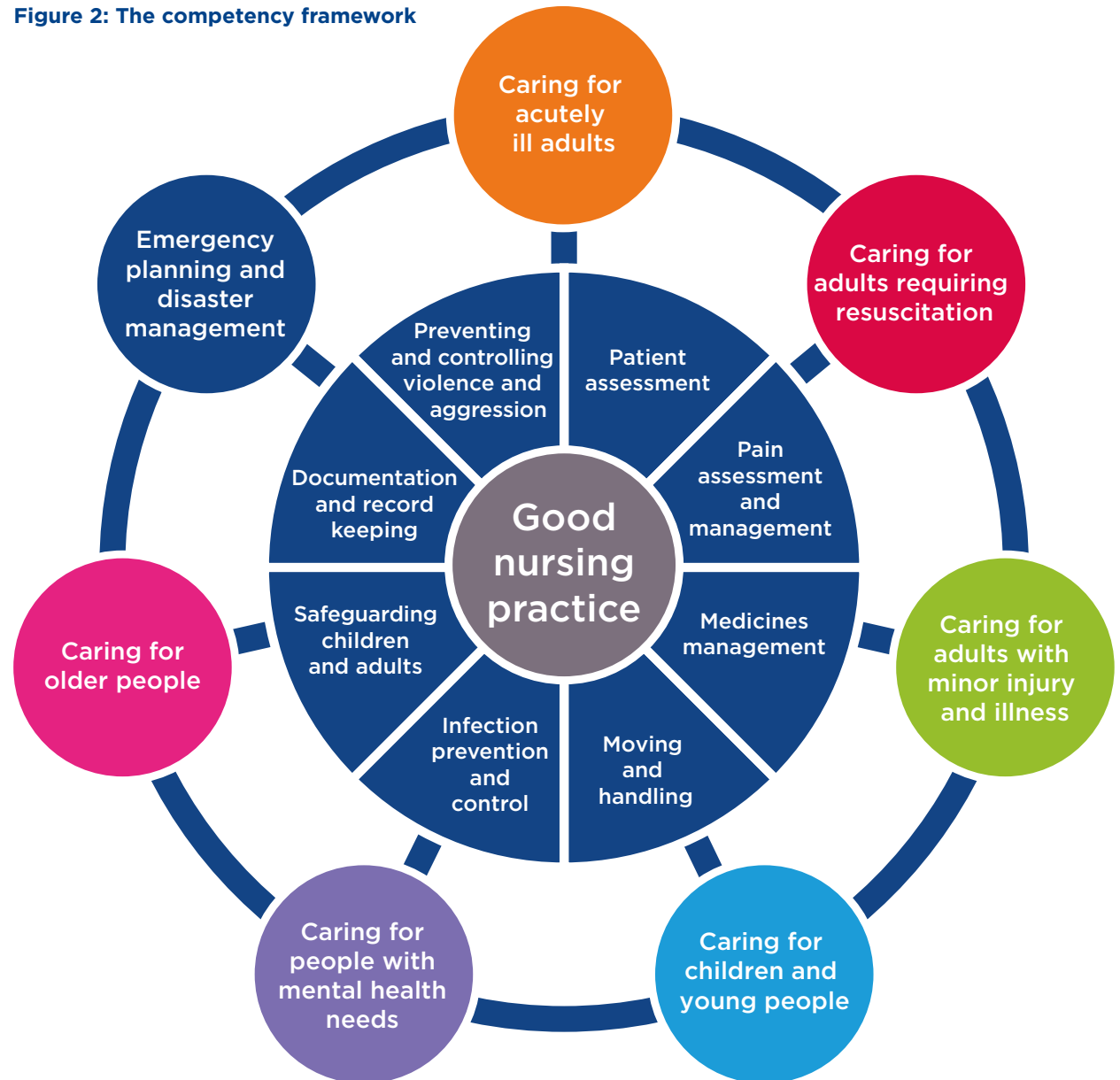
Figure 2: The competency framework

These sections appear in both Level 1 and Level 2 competency sets.